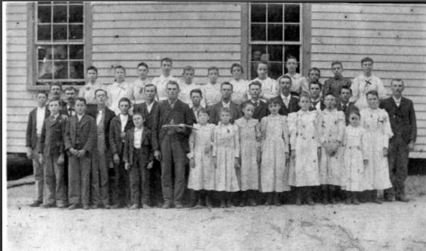
Singing School (1892) Macedonia Church Marcoot, AL